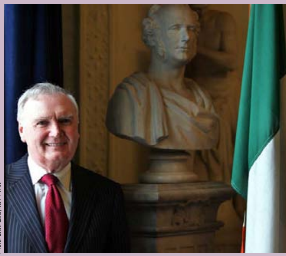
Dermot Gallagher - "one of Ireland's most distinguished public servants" says Justice Minister