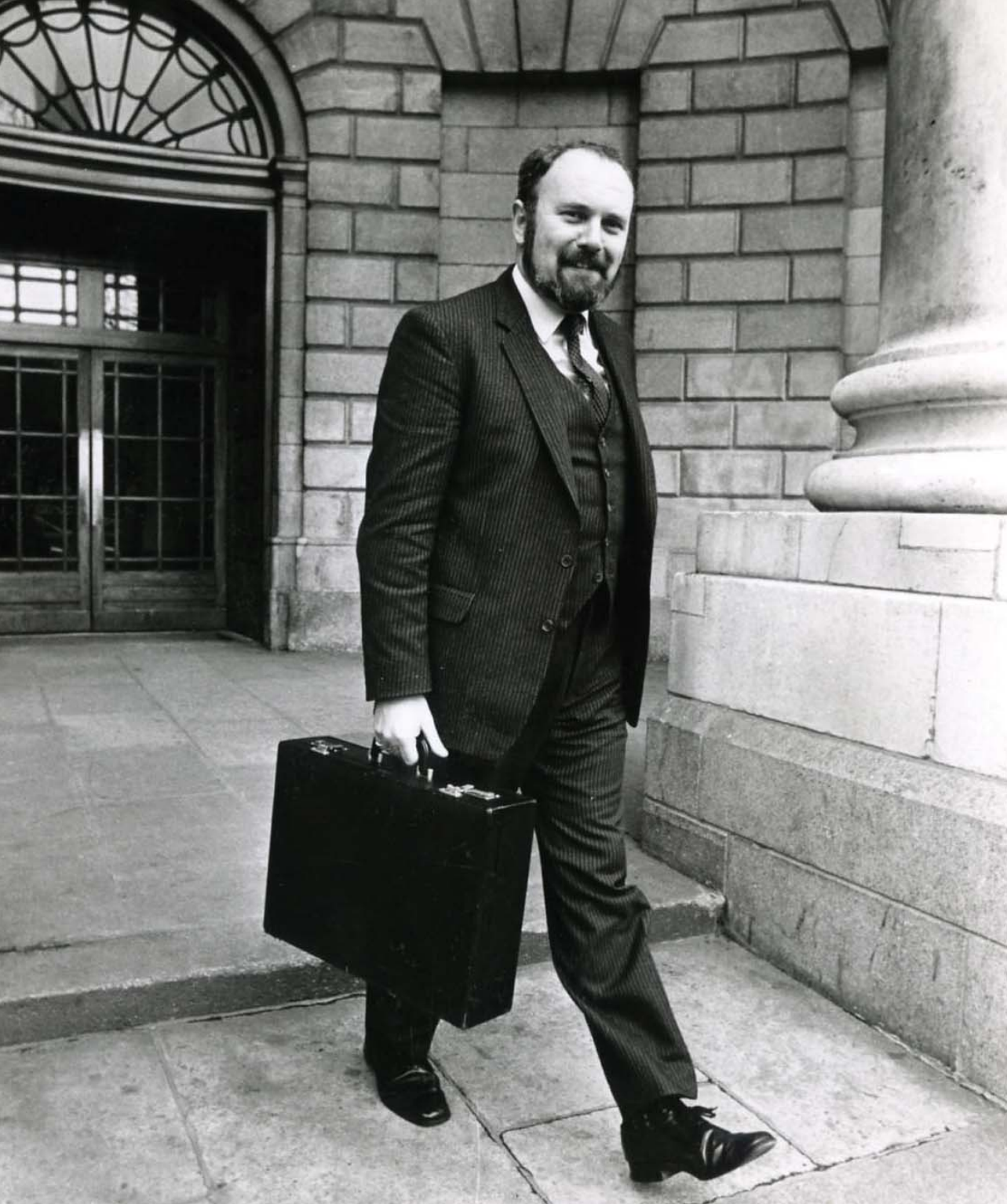
Senator David Norris, a long-standing member of the ICCL.