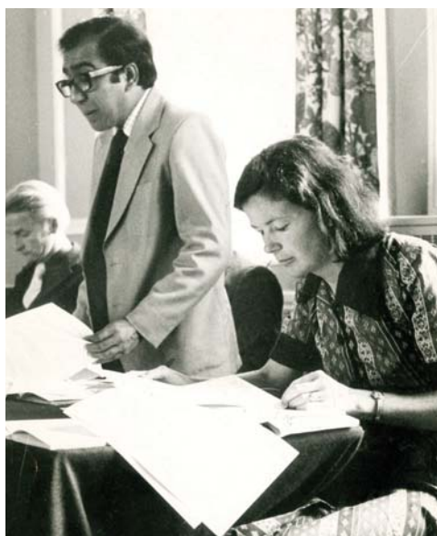
Kader Asmal and Mary Robinson at an ICCL press conference in 1976.

The decision in principle to establish an independent ombudsman for the Garda in 2004 was a significant victory for the ICCL after almost 30 years of campaigning on the issue. The Garda Síochána Ombudsman Commission will become operational in 2006. This new body has powers which, if fully implemented in practice, will enable it to hold members of An Garda Síochána to account for their actions in a manner that is consistent with Ireland's obligations under international human rights law. The ICCL intends to closely monitor the work of the Ombudsman Commission.