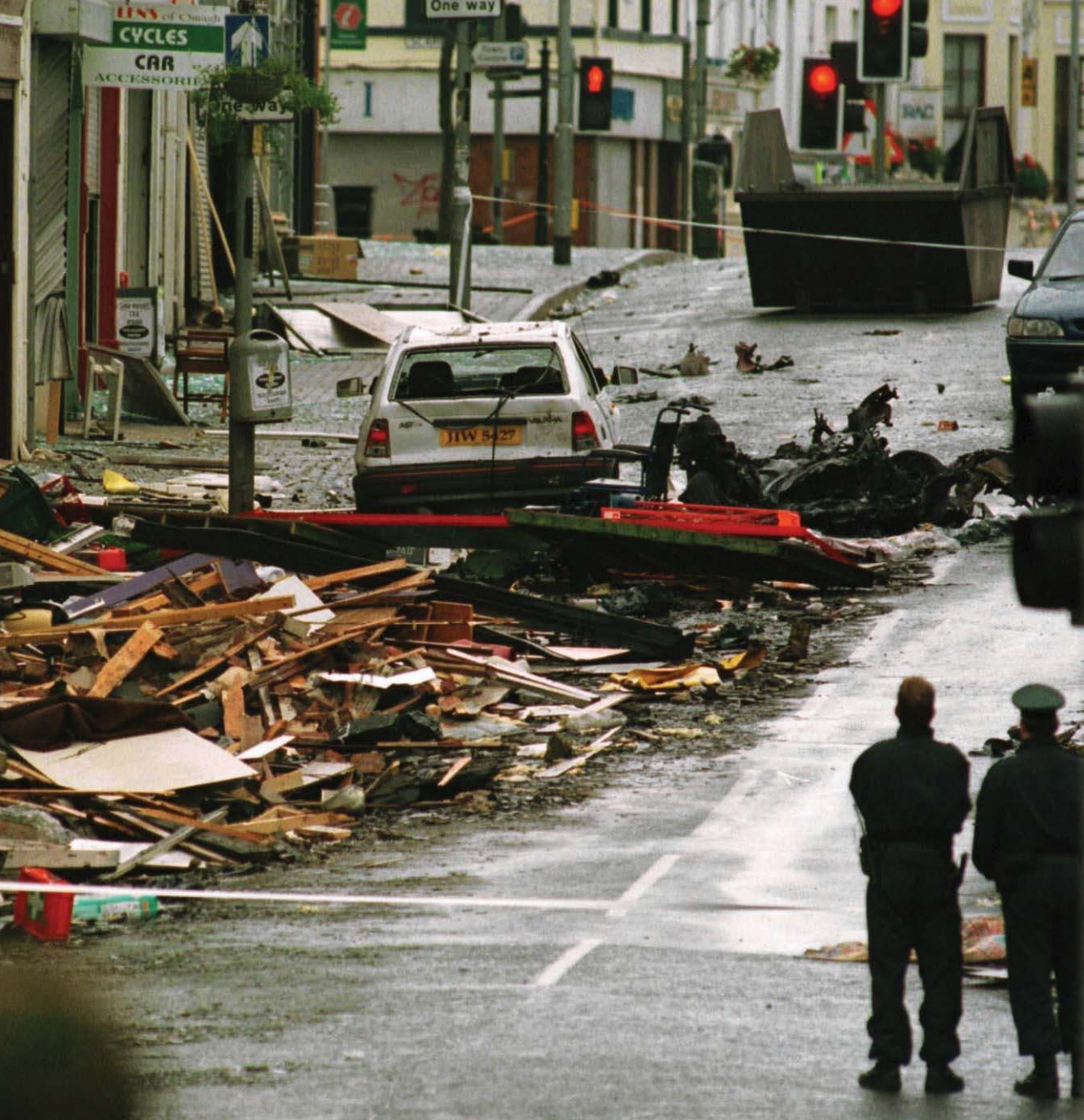
The aftermath of the Omagh bombing in August 1999, which killed 28 people.