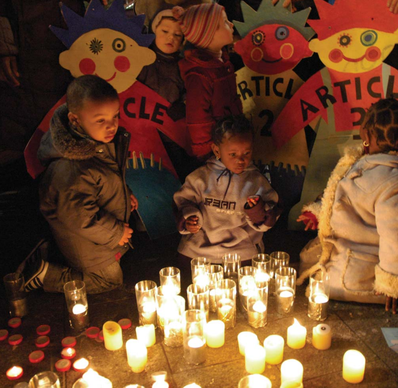
Young campaigners attend a vigil to protest the deportation of Irish children.