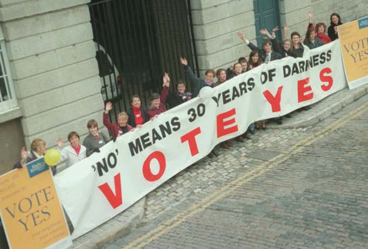
Some 50.2% voted Yes in the 1995 divorce referendum