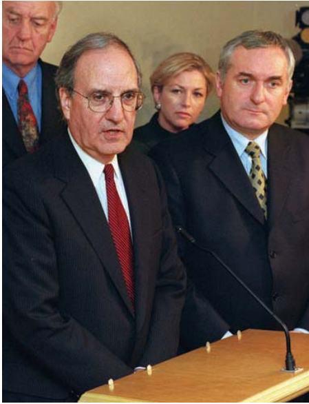
Former US Senator George Mitchell with An Taoiseach Bertie Ahern, speaking in the months following the signing of the Good Friday Agreement in 1998.

Oireachtas submissions and campaigns organised in conjunction with other organisations ultimately helped ensure the Government appointed a representative team of commissioners.