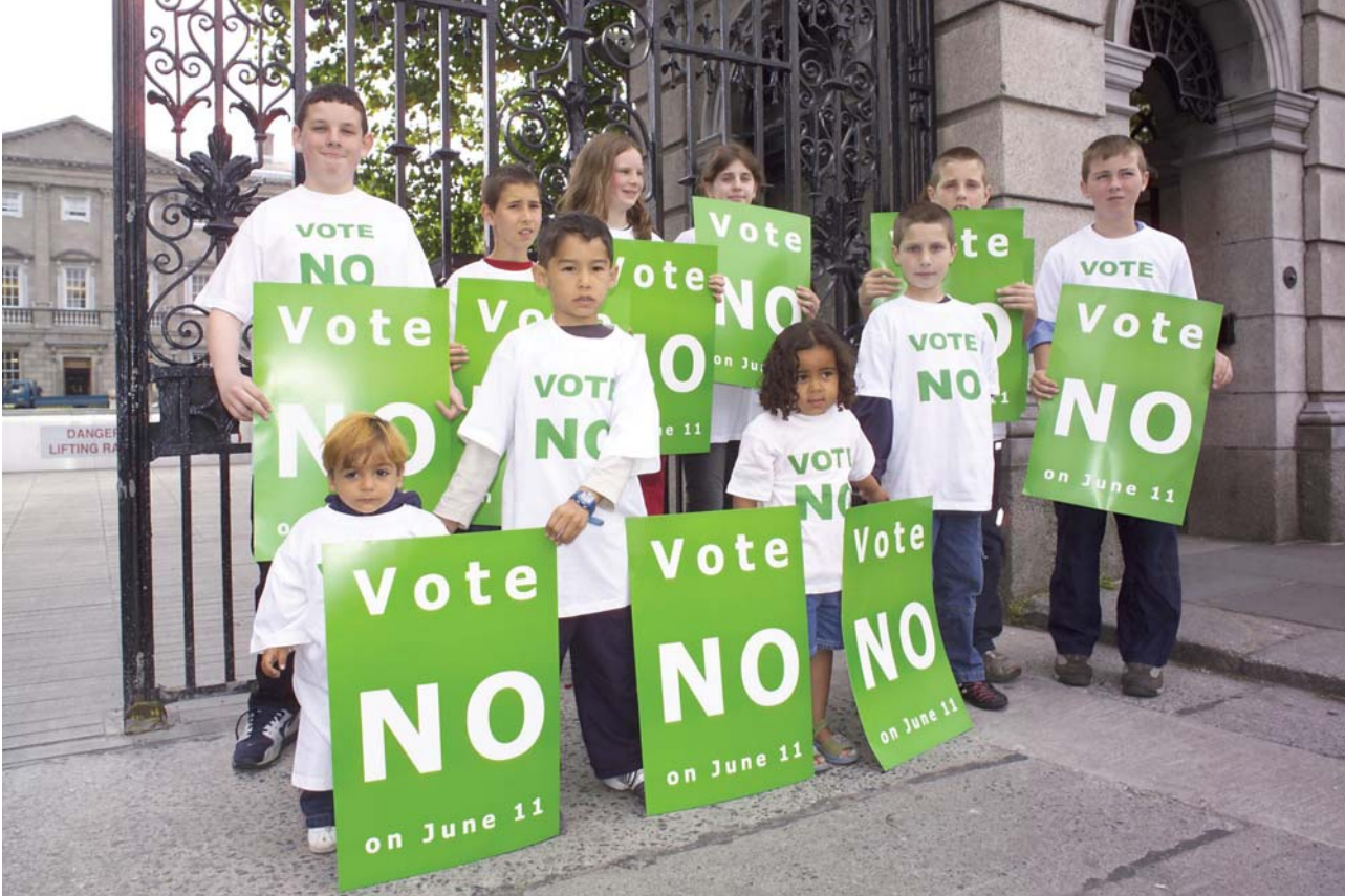
Children calling for a NO vote in the 2004 Referendum on Citizenship.

to the establishment of the Coalition Against the Deportation of Irish Citizen Children (CADIC). This campaign was successful in finally securing residency rights for migrant parents in December 2004.