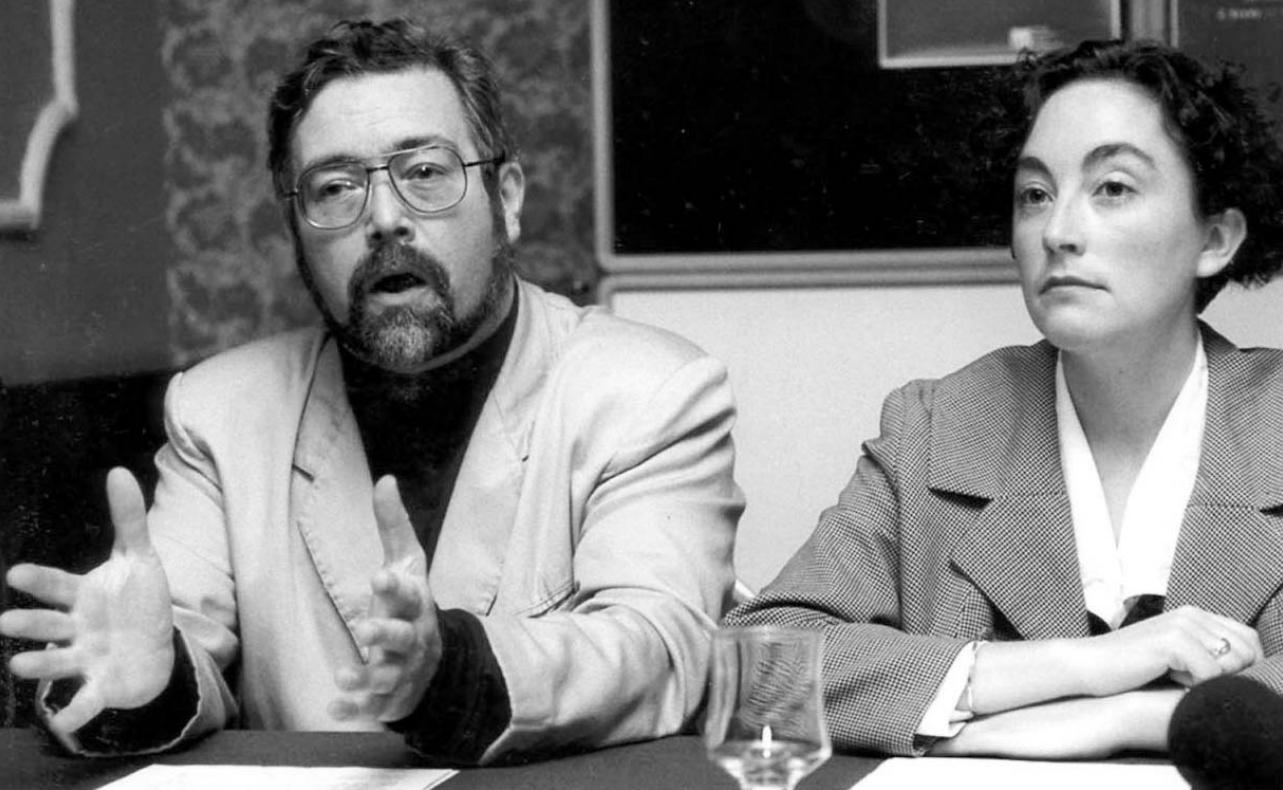
A Right to Remarry Campaign press conference in November 1996, ahead of the divorce referendum