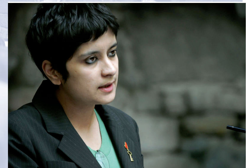
Shami Chakrabarti speaking at the ICCL's Law Library Lecture

Protecting Civil Liberties, Promoting Human Rights is available for sale for €5.95 from the ICCL, 9-13 Blackhall Place, Dublin 7.