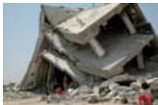
Gaza: Post Operation Cast Lead Dearbhla Glynn (Director)

This charming stop-motion animation by Paul O'Brien tells the tale of an elderly man who is banished from the family dinner table for being a sloppy eater. The film neatly deals with the prejudices that older people face on a daily basis, sometimes even from their loved ones. The film's message is loud and clear – we will all be old one day, and older people must be treated with the dignity, inclusion and respect they deserve.