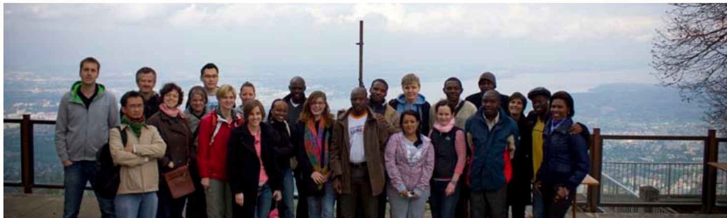
Widening horizons: participants in the Geneva training programme