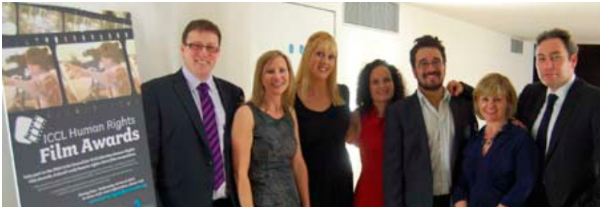
The ICCL staff at the Light House Cinema