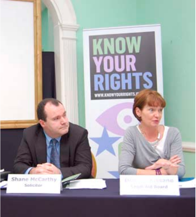
Taking questions from the floor